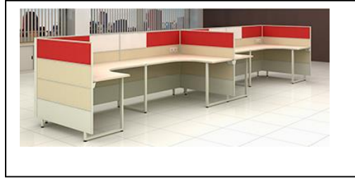
Table top: 1500mm width X 600mm depth X 25mm Thick PLB Table Top with post formed edge. Grommet hole for wire entry. Screen Height 3' 6". Front screen: 54mm thick screen with halflength Fabric-magnetic panel and half-length white board /glass.

Side screen (Partition screen): 25mm thick fabric/glass panel