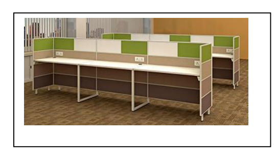
Table top: 1500mm width X 600mm depth X 25mm Thick PLB Table Top with post formed edge. Grommet hole for wire entry.

stand/CPU trolley (Please refer attached sketch Fig.1, 2)