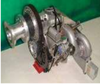
5A exhibit - Eco-friendly process for Al alloy (podium height 20 inches)