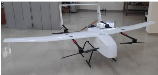
3A exhibit - Carbon Fiber & Prepreg (podium height – 20 inches)